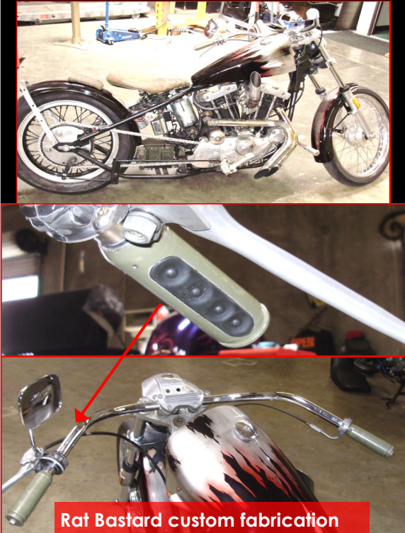
Rat Bastard custom fabrication

Why pay a small fortune in labor to wire your handlebars? Just run one wire, coming from your left handgrip, through your bars and your finish.