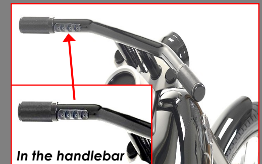
In the handlebar